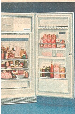
PHILCO 11 CU. FT. REFRIGERATOR