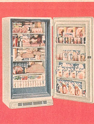
PHILCO 12 CU. FT. FREEZER