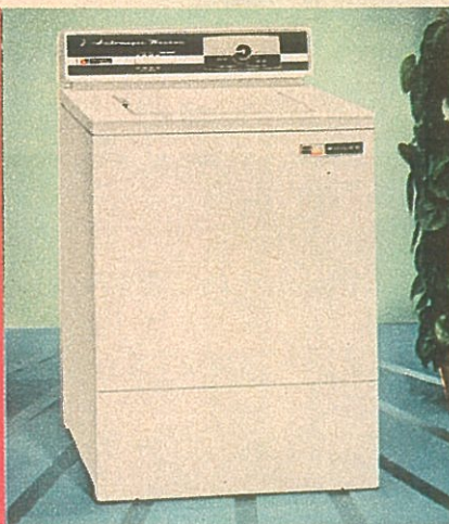
PHILCO AUTOMATIC WASHER