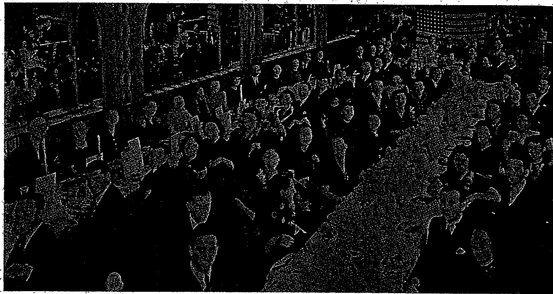
The Standard Toykraft Dinner at the Mirror Room, Hotel St. George, Brooklyn